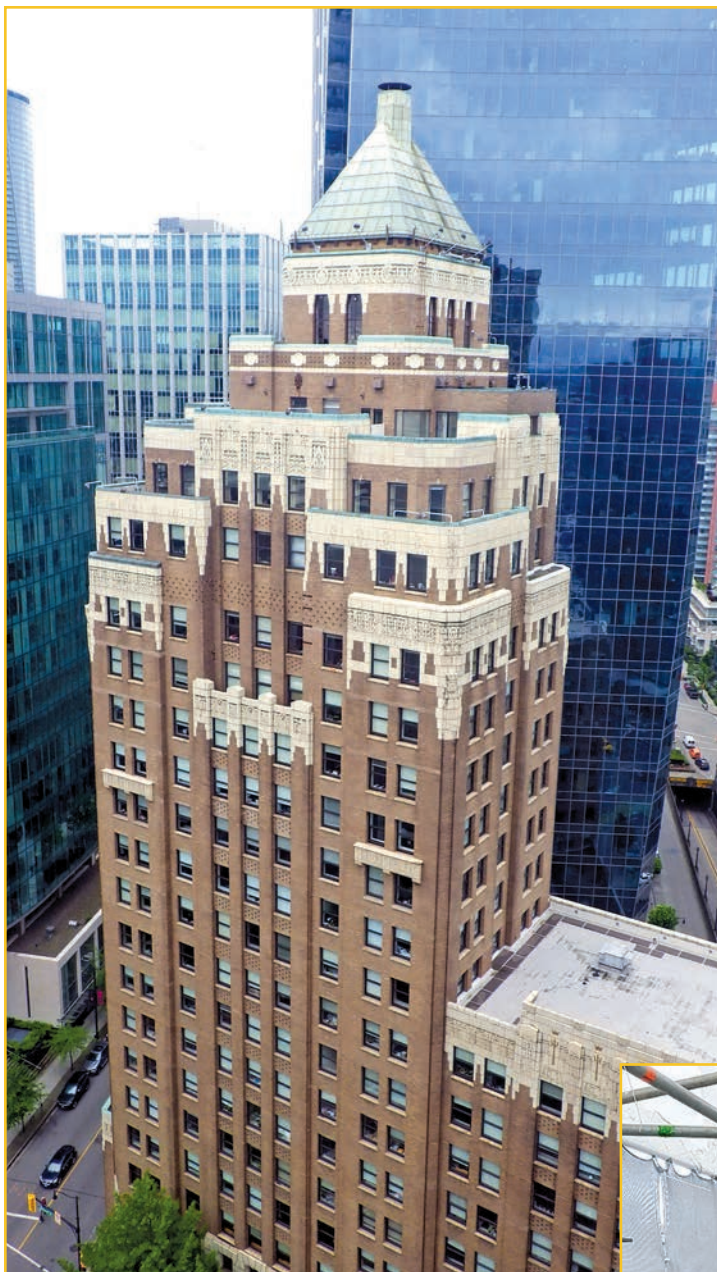
Figure 2 – The Marine Building, located in downtown Vancouver, British Columbia, Canada. When the Marine Building opened in 1930, it was the tallest building in the British Empire. The Marine Building is an exemplar of the Art Deco style.

preservation, rehabilitation, restoration, or a combination of these actions or processes. 5