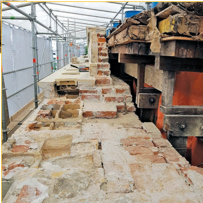
Figure 3 – Reconstruction of a terra cotta cornice, including upgrades to the structural support as part of a conservation activity. The cornice is a character-defining element of the historic building.

To understand the significance of a given historic building, it is necessary to begin with research. Is the building simply old (“historical”), or is the building in fact a recognized historic place or historic property? During an initial research phase of the building, we can discover information that helps focus the scope of the proposed conservation activities: